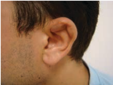
Figure 1. The lesions that affected the superior scaphoid fossa were 16x16 mm and 10x10 mm in diameter, respectively

A 22-year-old man was admitted to our clinic with a history of painless swelling of the left auricle at the superior scaphoid fossa for two weeks. The patient had no history of microtrauma associated with occupational or behavioural activities and declined any history of trauma. On physical examination, the patient had two prominent, fluctuant swelling at the left superior scaphoid fossa with a normal overlying skin. The lesions that affected the superior scaphoid fossa were 16x16 mm and 10x10 mm in diameter, respectively (Figure 1). The diagnosis of the lesion depended on the typical history and clinical findings.