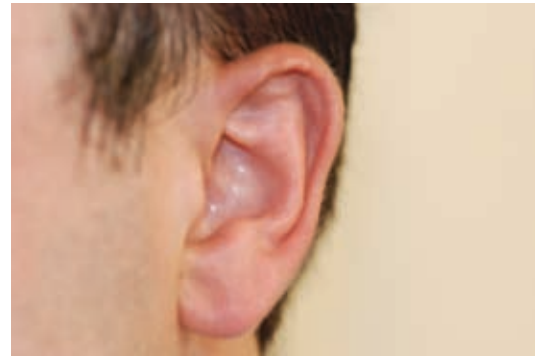
Figure 3. Four weeks after the intervention, there was no recurrence of the pseudocyst with an enviable cosmetic outcome

pseudocystic collection was aspirated into an empty injector. Using another injector, steroid fluid (triamcinolone suspension) was injected into the pseudocystic cavities until they achieved the original sizes. Then gauze was pressed onto the auricular surface to stop the bleeding. The aspirated fluid was examined histopathologically. There were foamy macrophages in a proteinaceous background (PapX40) (Figure 2). Four weeks after the intervention, there was no recurrence of the pseudocyst with an enviable cosmetic outcome (Figure 3).