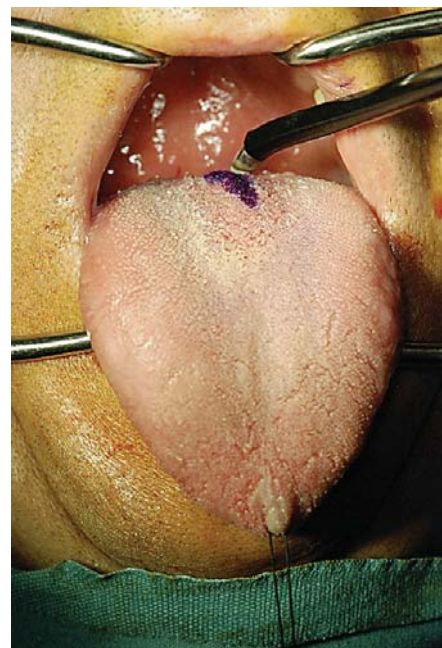
Fig. 1. Black silk suture tied from the tip of the tongue to the suspension of the tongue.

Figure 3 shows the preoperative and postoperative appearances of the tongue base in the same patient using a flexible nasopharyngoscope.