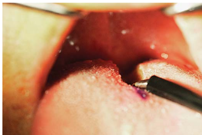
Fig. 2. Care was taken to stay within 1–1.5 cm of the midline and medial to the previously marked boundaries.

Four adverse effects were observed in 16 subjects. These were pain necessitating the use of analgesic for more than 5 days (5/16), difficult swallowing that lasted longer than 10 days after surgery (2/16), difficulty swallowing solid foods for more than 30 days after operation (9/16), and halitosis for more than 30 days after the operation (1/16).