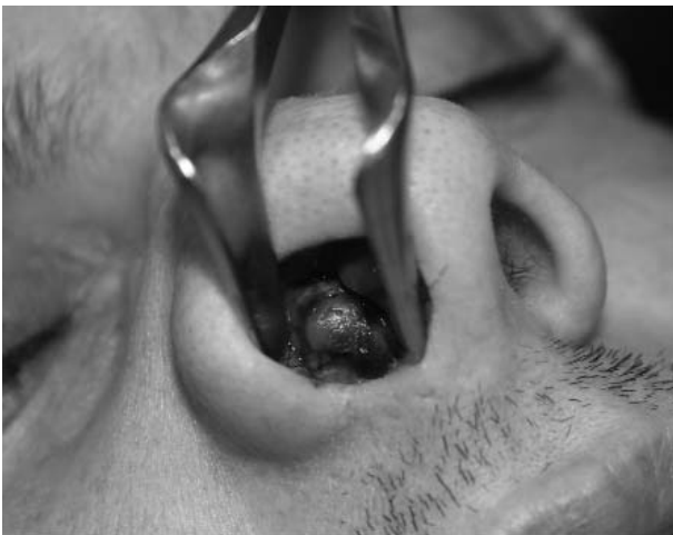
Figure 1. Giant lobular capillary hemangioma of the right nasal cavity.

Although LCH may appear in all ages, it is more common in the third decade and in females. The most common sites of mucosal LCH are the gingiva, lips, tongue, and buccal mucosa, but nasal cavity involvement is unusual, with the anterior portion of the septal mucosa and the tip of the turbinate as the most frequently involved areas in the nasal cavity (1,3). In our case, LCH was on the posterosuperior portion of the septal mucosa.